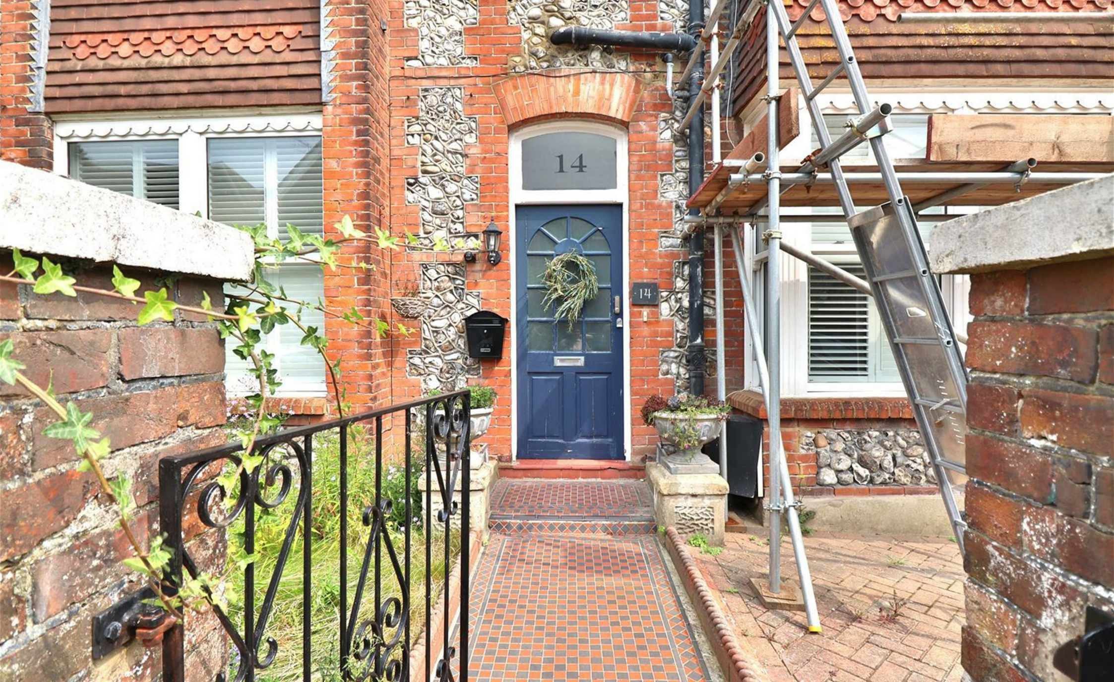
14 Salisbury Road, Worthing, BN11 1RB £625